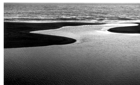
Where the Gualala River meets the ocean.

A copy of the NCWAP Manual is available on line at www.swrcb.ca.gov/rwacb1/ 🌲