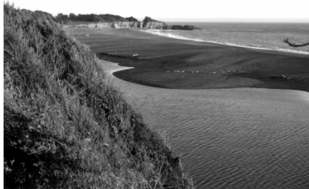
On a quiet evening, from the Gualala Bluff Trail, look out over the Gualala River Estuary, the Gualala Point Park and the Pacific Ocean. Peace is with you.